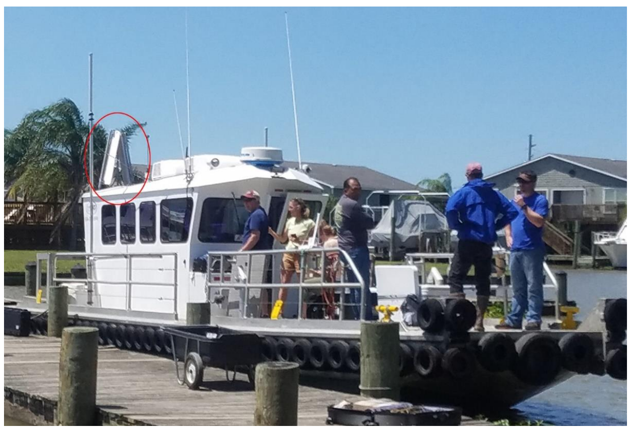
OI/MSRC communication system antenna installed on the 44-foot "Miss D" sampling vessel. Oil location, extent and thickness imagery/information were sent down from the aircraft within 10-15 minutes of data acquisition to the crew sampling the oil on the ocean's surface below.

On April 25, 2017, OI and MSRC participated in study to help validate remote sensing data by collecting oil thickness data along with bulk oil samples to determine water content of the oil simultaneously with the acquisition of satellite and aerial remote sensing data. Prior to this exercise MSRC had thoroughly tested and proved the capabilities of this system, yet never before had TRACS data showing oil on water been transmitted down to a vessel the size of the sampling vessel used for the research (the Miss D - 44 feet in length) within a few minutes of acquisition.